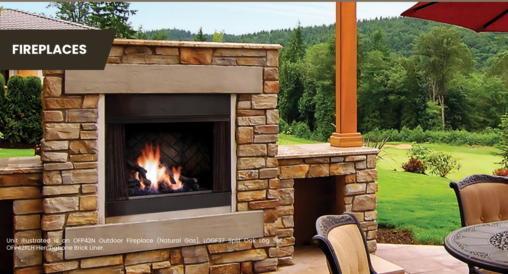
Unit illustrated is an OFP42N Outdoor Fireplace (Natural Gas), LOGF37 Split Oak Log Set, OFP42RLH Herringbone Brick Liner.

Light up your nights. Designed for your outdoor oasis, this fireplace captures your attention with its Satin Coat Black or Stainless Steel Finish and your choice of brick liner.