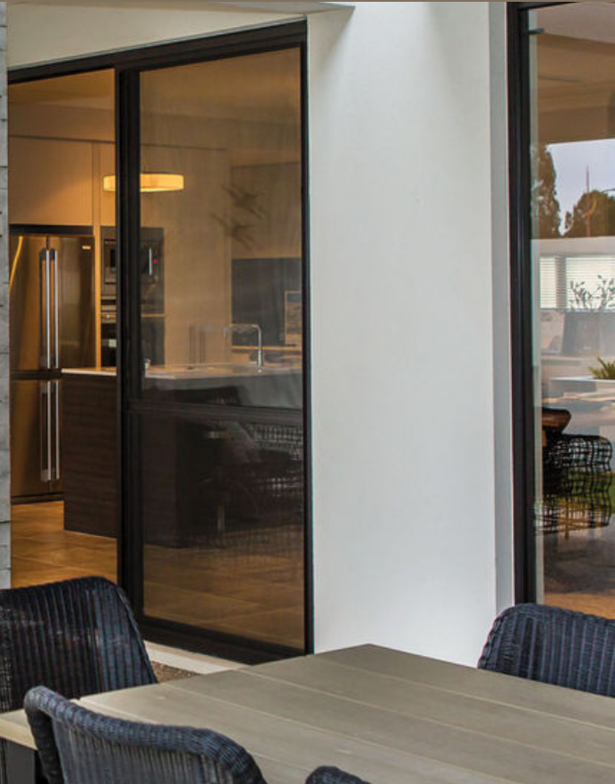
Unit illustrated is a OFP5548S1N Outdoor Linear Gas Fireplace (Single Sided - Millivolt/Natural Gas), MQG5C Glass Media (Bronze x4), RBCB1 Cannonballs (Assorted 14 pc set).

Dramatically change the look and feel of your patio with the sleek, clean-view style of the Barbara Jean Collection Outdoor Linear Fireplace. Choose from a single sided or see-through option and three sizes to suit your outdoor space. Bringing your vision to life is simple with accents of ember glass, Driftwood logs, and decorative stones and rocks.