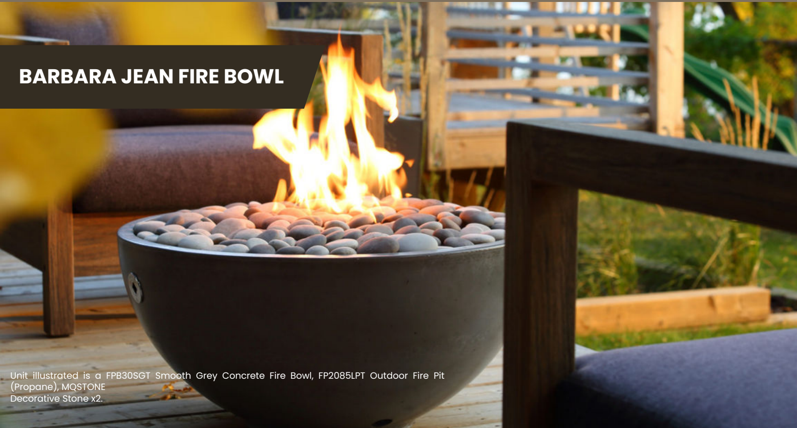
Unit illustrated is a FPB30SGT Smooth Grey Concrete Fire Bowl, FP2085LPT Outdoor Fire Pit (Propane), MQSTONE Decorative Stone x2.

The Outdoor Fire Pit or Bowl is the perfect way to enhance your enjoyment of any outdoor space. Ideally suited for use on a wood deck or patio, the Outdoor Fire Pit and Bowl come complete with lava rock and are fuelled by either natural gas or propane. Decorate your Outdoor Fire Feature with the choice of decorative stones, or five different colors of crushed glass media.