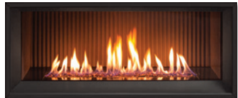
Fluted Liner – Bezel Base