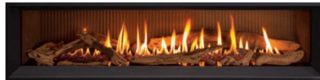
Fluted Liner – Ultra High Definition Log Set