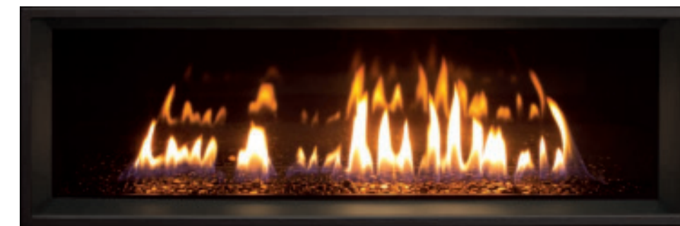
Black Enameled Liner – Full Glass Tray