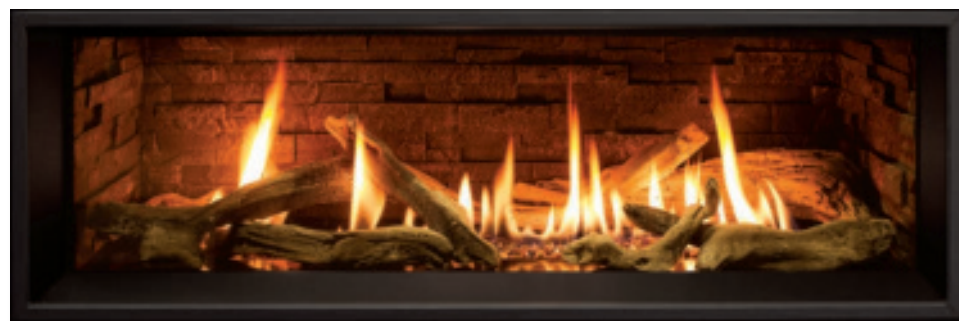
Ledgestone Liner – Ultra High Definition Log Set