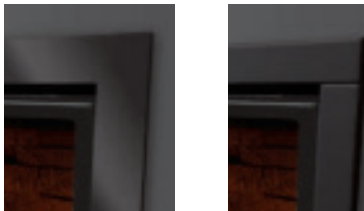
Powder Coated Borderview Surround 1 1/4 Slim Line Surround Painted Black Compatible with all units