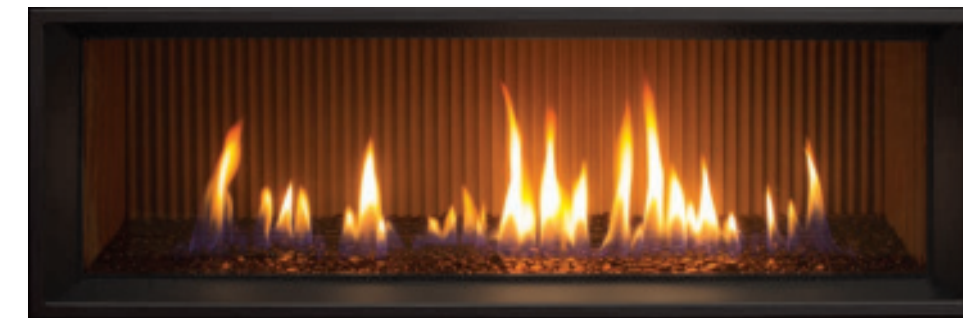
Fluted Liner – Full Glass Tray