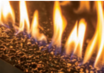
Compatible with all units