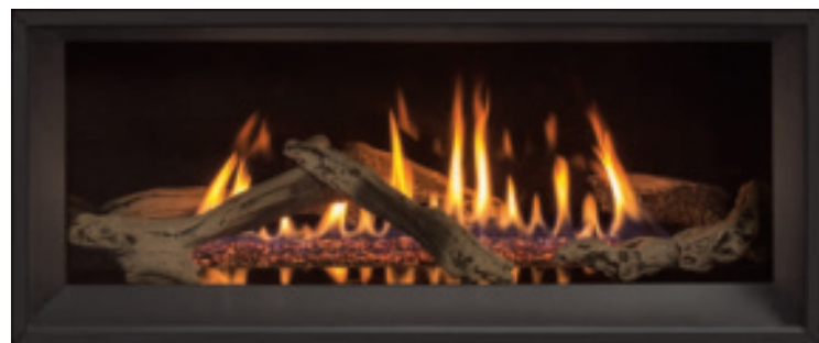
Black Enameled Liner – Ultra High Definition Log Set