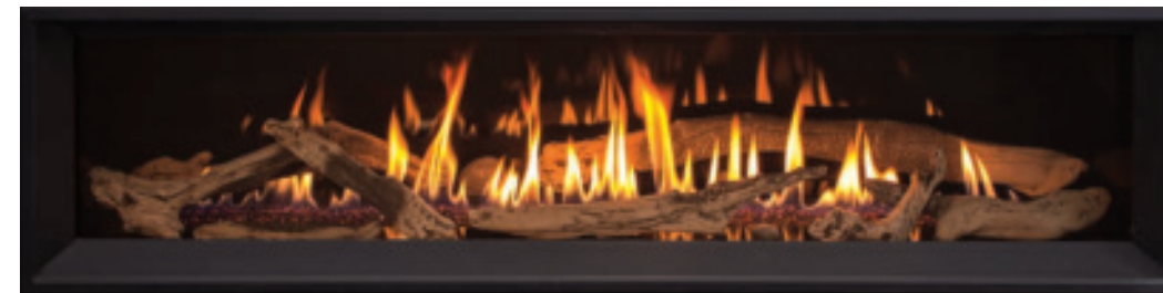
Black Enameled Liner – Ultra High Definition Log Set