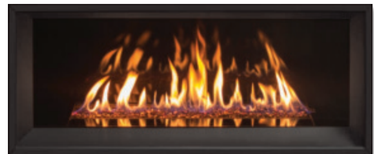
Black Enameled Liner – Bezel Base