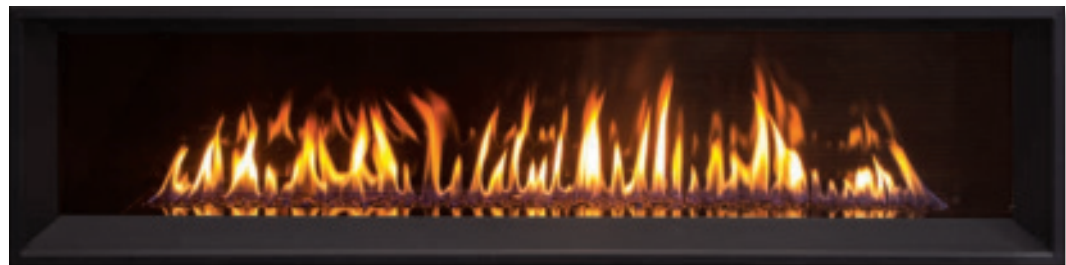
Black Enameled Liner – Bezel Base