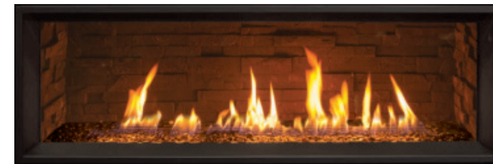
LedgeStone Liner – Full Glass Tray