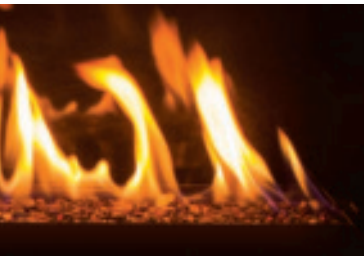
Includes Vermiculite Included with all units