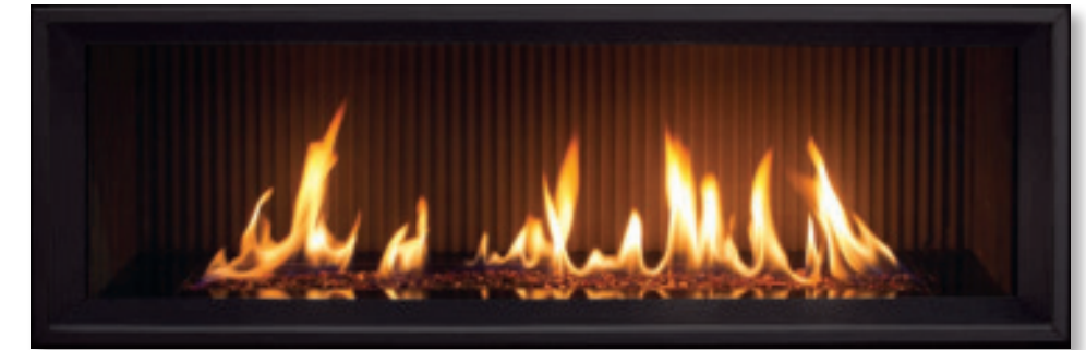
Fluted Liner – Bezel Base