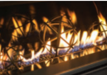
Compatible with all units