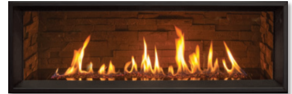
Ledgestone Liner – Bezel Base