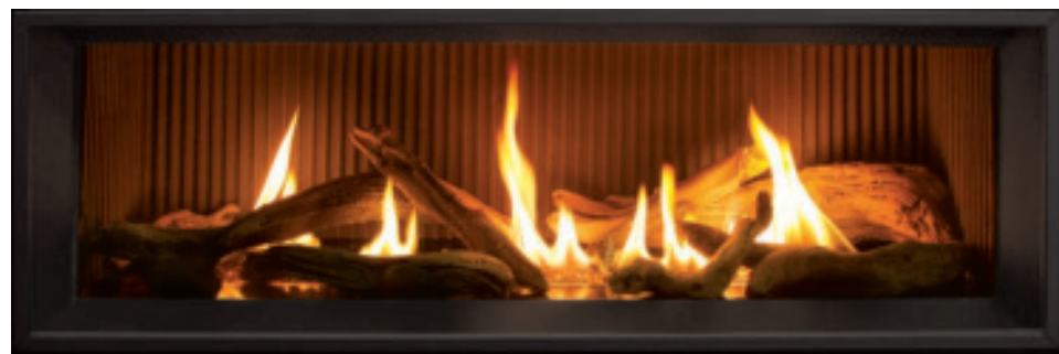
Fluted Liner – Ultra High Definition Log Set