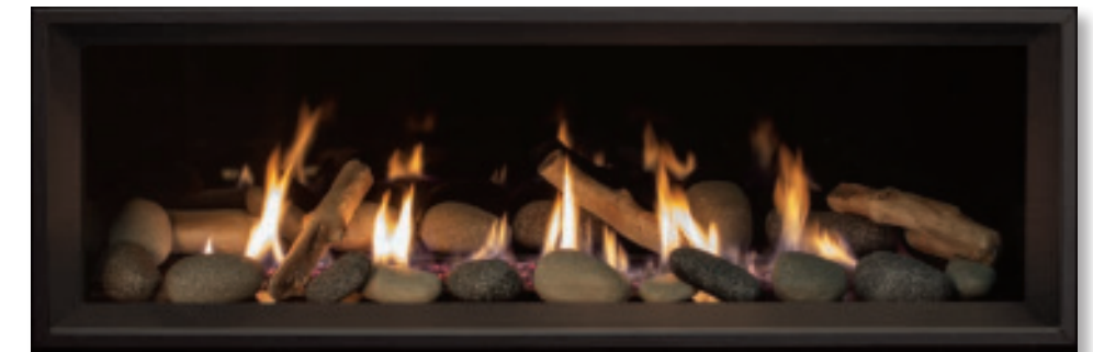
Black Enameled Liner – River Rock Set with Twigs