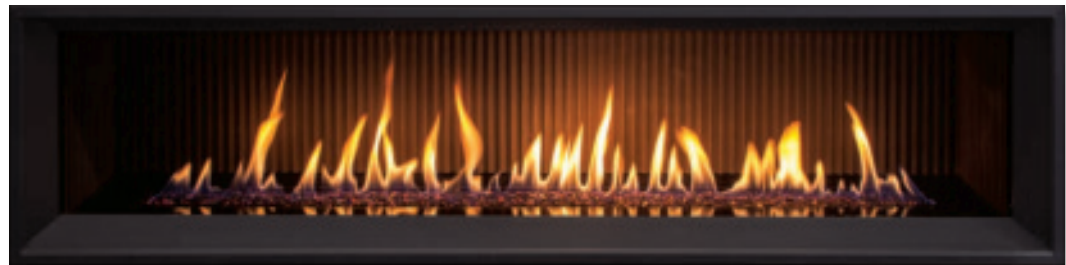
Fluted Liner – Bezel Base