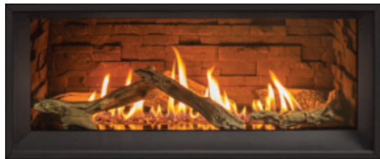
Ledgestone Liner – Ultra High Definition Log Set