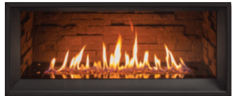
Ledgestone Liner – Bezel Base