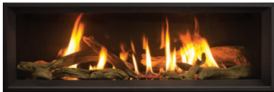
Black Enameled Liner – Ultra High Definition Log Set