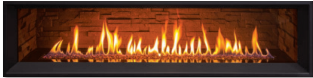
Ledgestone Liner – Bezel Base