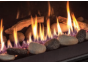
Compatible with all units