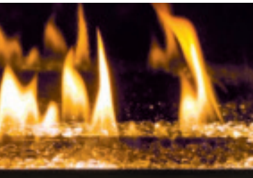
Compatible with the C34, C44, & C60