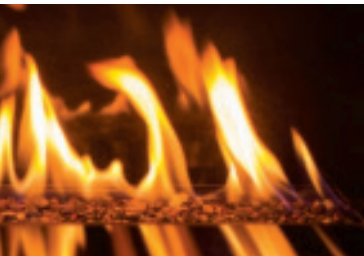
Compatible with all units