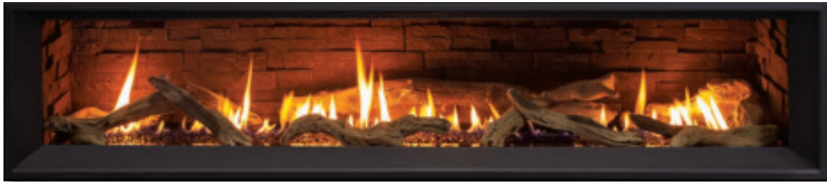
LedgeStone – Ultra High Definition Log Set