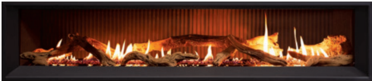
Fluted Liner – Ultra High Definition Log Set