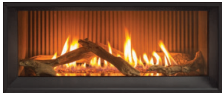
Fluted Liner – Ultra High Definition Log Set