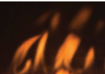
Compatible with all units