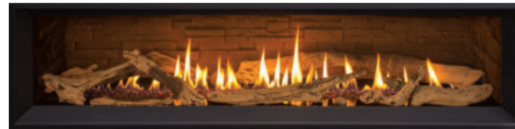
LedgeStone Liner – Ultra High Definition Log Set