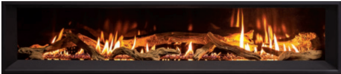
Black Enameled Liner – Ultra High Definition Log Set