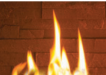
Compatible with all units